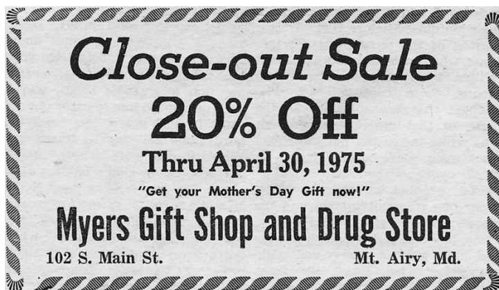
Ad from the Community Reporter April 25, 1975