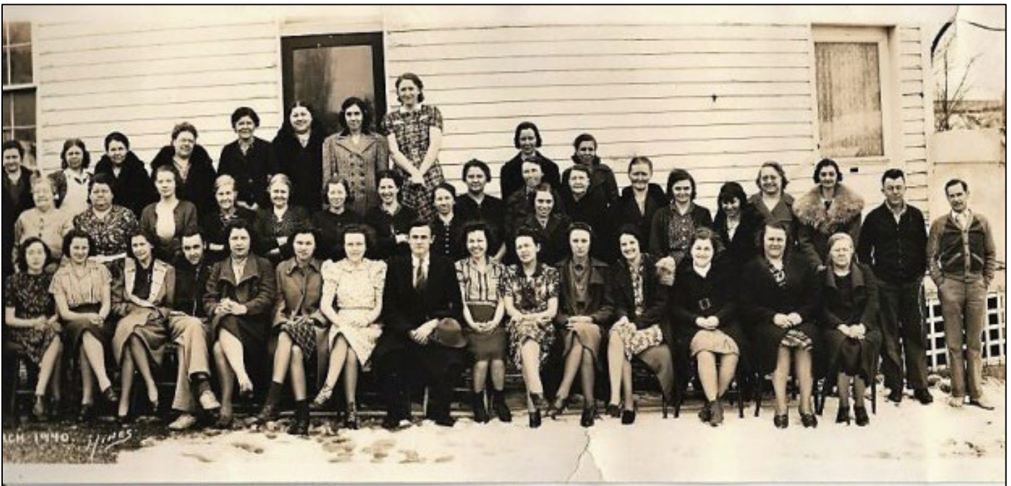
1940 Mount Airy Pants Factory Staff at the Prospect Road Plant